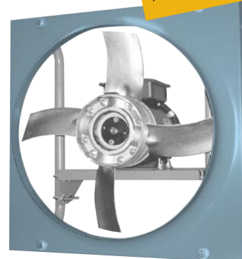
G-Duty Panel Fan with Adjustable Pitch Prop