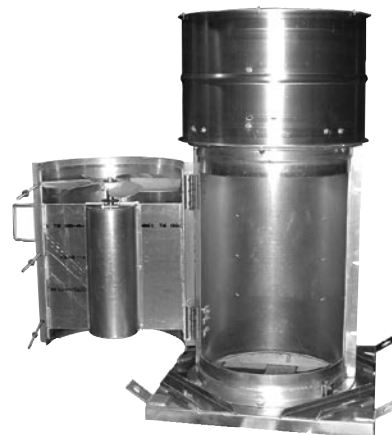
Belt Drive Upblast Roof Ventilator with swingout for easy maintenance