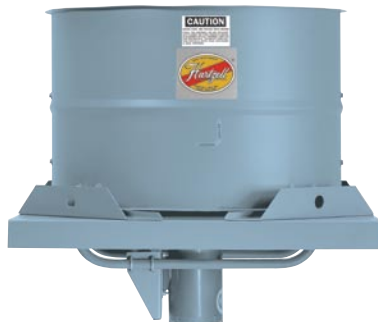
Upblast Roof Ventilator