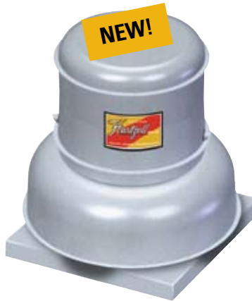
Fiberglass Roof Exhauster Available in Upblast or Downblast