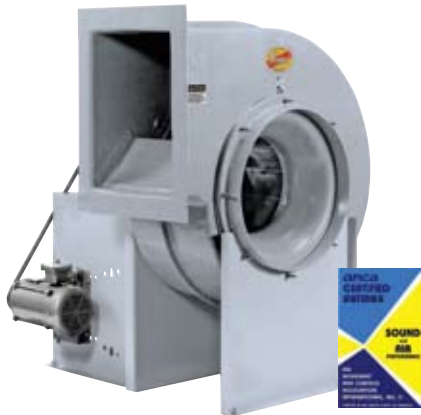
Fiberglass Backward Curved Centrifugal Features our unique one-piece solid FRP wheel (soon available with 2" additional SP)