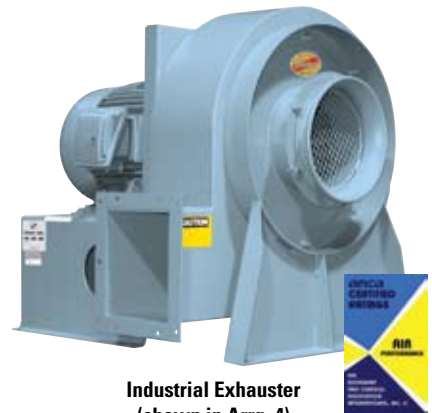
Industrial Exhauster (shown in Arrg. 4)