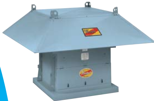
Direct Drive Hooded Roof Ventilator (Available through 84")