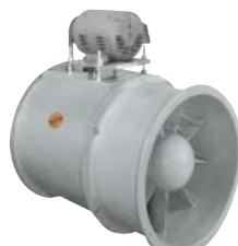
Fiberglass Axial Flow Fans