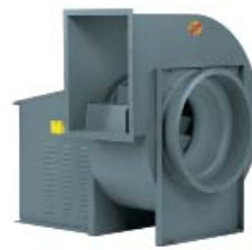
Steel Centrifugal Blowers