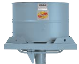
Roof Ventilators – Steel & Fiberglass