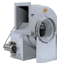
Fiberglass Centrifugal Blowers