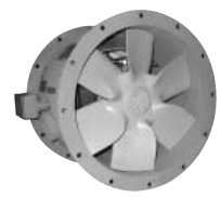
Marine – Mine Duty Blowers

Hartzell Fan, Inc., Piqua, Ohio 45356 • Plants in Piqua, Ohio and Portland, Indiana.