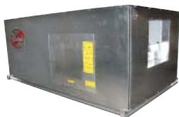
Heating Equipment – Gas & Steam