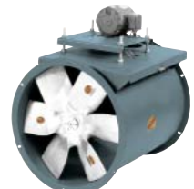
Duct Axial Fans