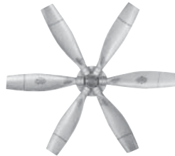
Cooling Tower & Heat Exchanger Fans